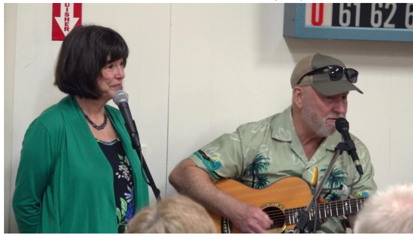
Awesome folk duo