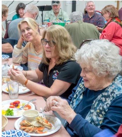
Mom & daughters